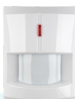
1x PIR-Sensor (included)